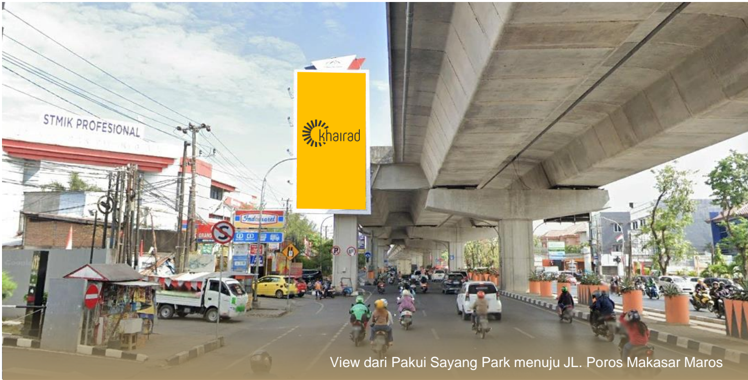
View dari Pakui Sayang Park menuju JL. Poros Makassar Maros